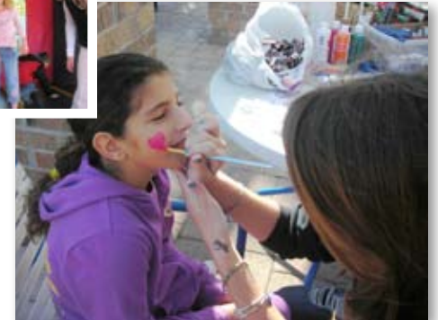
More pictures can be found at www.meadowpointecdd.com .